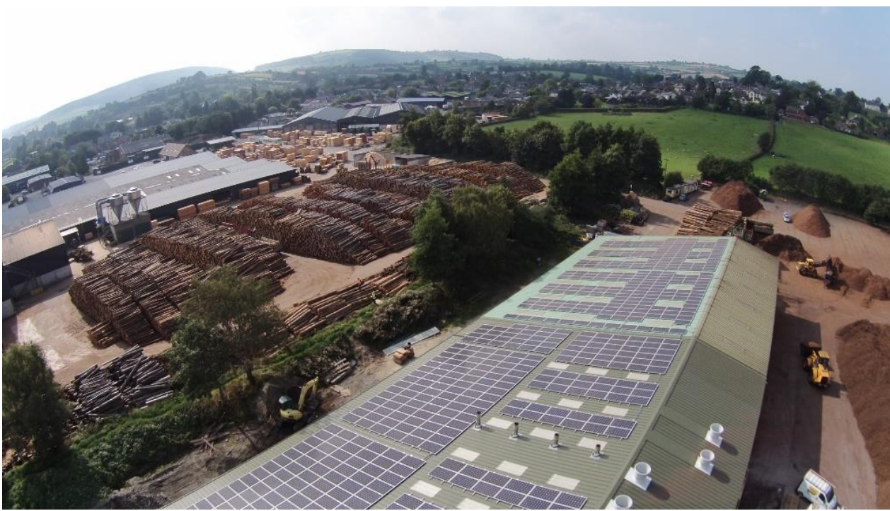
Bishops Castle, Shropshire