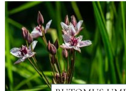
BUTOMUS UMBELLATUS 'ROSENROT'

Otherwise known as the devils bit scabious, these beautiful tiny blue to purple flower heads dance in the breeze and attract many native butterfly, bee and insect species.