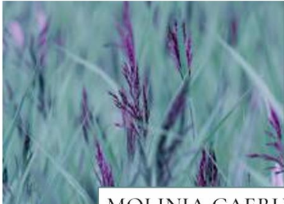
MOLINIA CAERULEA 'EDITH DUDSZUS'

With a colour scheme from the most delicate white to the richest deep purple, the garden offers a mixture of boldness and fragility – just as we find in nature.