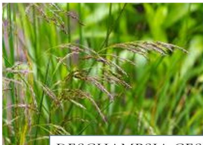
DESCHAMPSIA CESPITOSA BRONZESHLEIER

This wonderful marginal plant creates a sense of scale for any waters edge. In the wildlife pond, its tall umbellifer like flower heads support pollinators. Dragonfly larvae climb its stems for support as they emerge from their larvae casings.