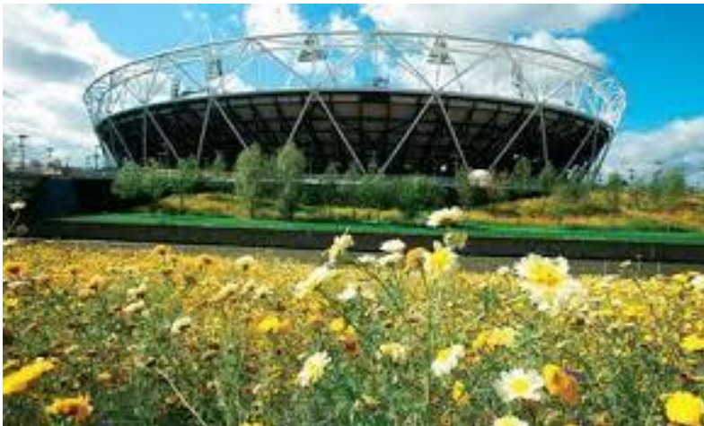
London 2012 – Queen Elizabeth Olympic Park

The 2016 Horticultural EXPO is in Antalya, Turkey from 23 April to 30 October 2016. More than 8 million visitors are expected over 6 months