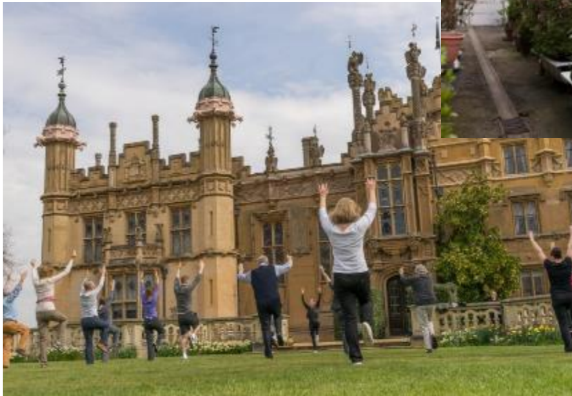
Knebworth during NGW