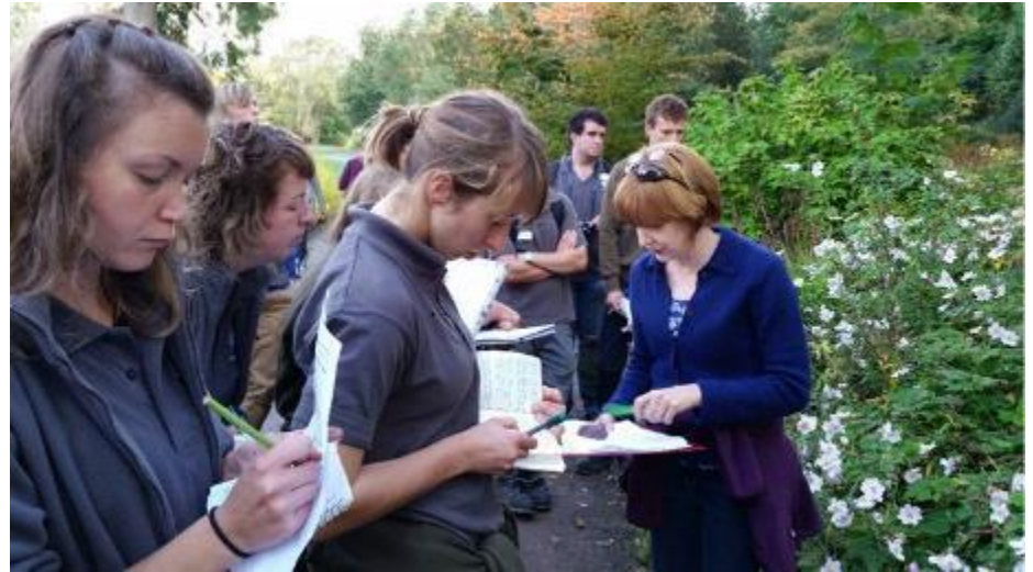
RHS Wisley students

The RHS has worked to help implement a Level 3 trailblazer apprenticeship in horticulture & landscape