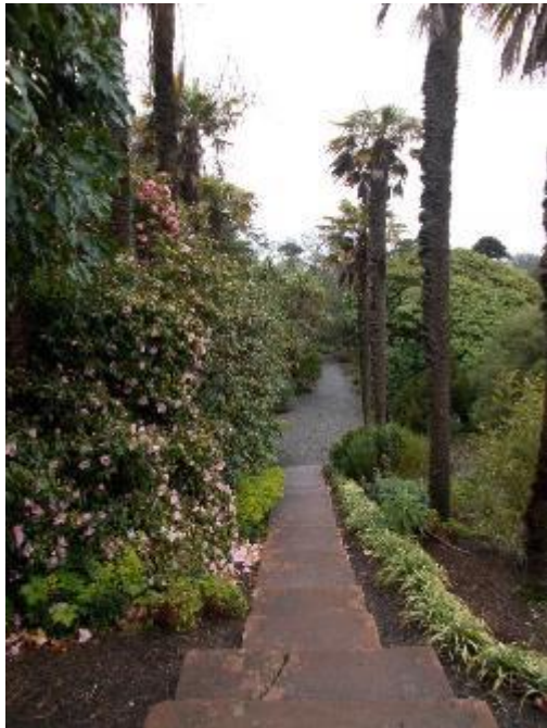
Scottish Garden Tour looking at Rhododendron propagation, Lisa Waters

RHS Bursaries develop experience, knowledge & career opportunities