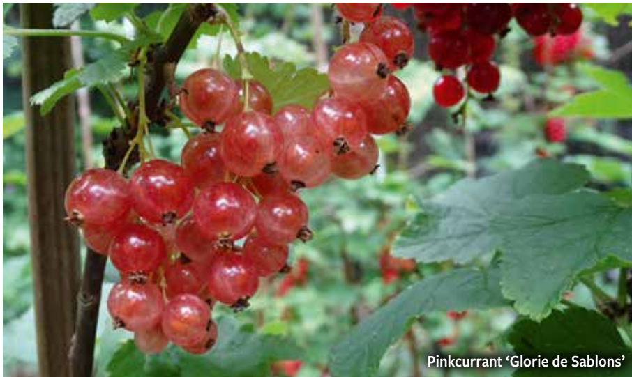
Pinkcurrant 'Glorie de Sablons'