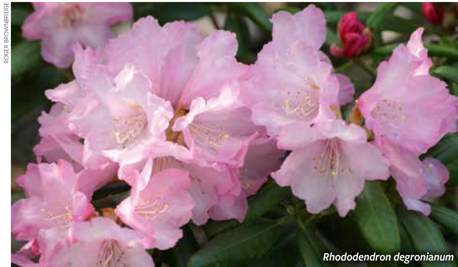
ROGER BROWN BRIDGE