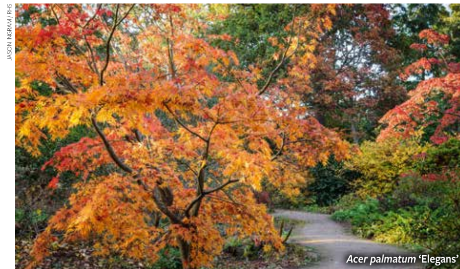
Acer palmatum 'Elegans'