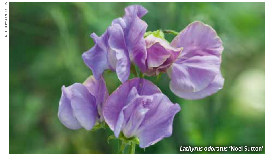
Lathyrus odoratus 'Noel Sutton'