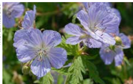
HARDY GERANIUM GROUP

A must for snowdrop enthusiasts, Group members brave the cold and meet in February to admire the diversity of these gorgeous bulbs and for a chance to buy some of the more unusual cultivars. galanthus@hardy-plant.org.uk