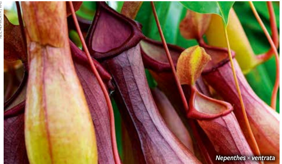
Nepenthes x ventrata