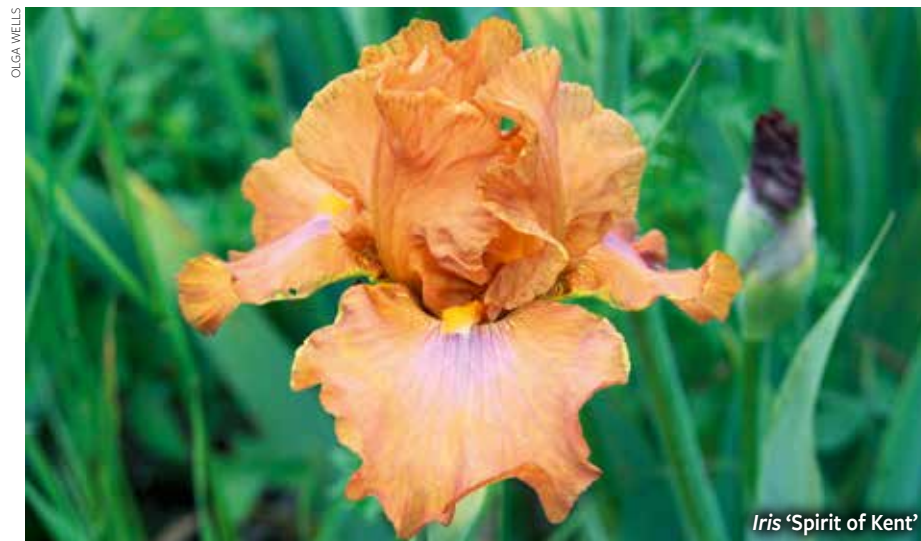
Iris 'Spirit of Kent'