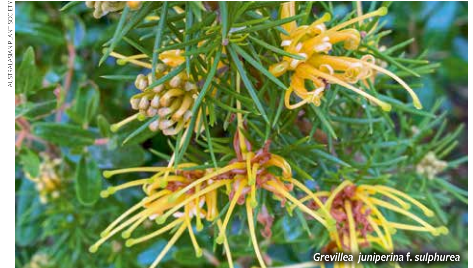
Grevillea juniperina f. sulphurea