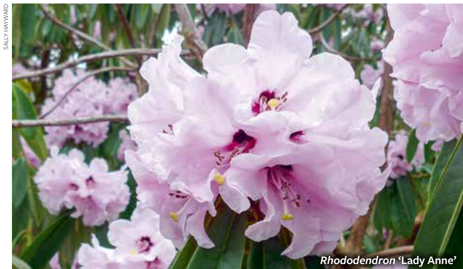
Rhododendron 'Lady Anne'