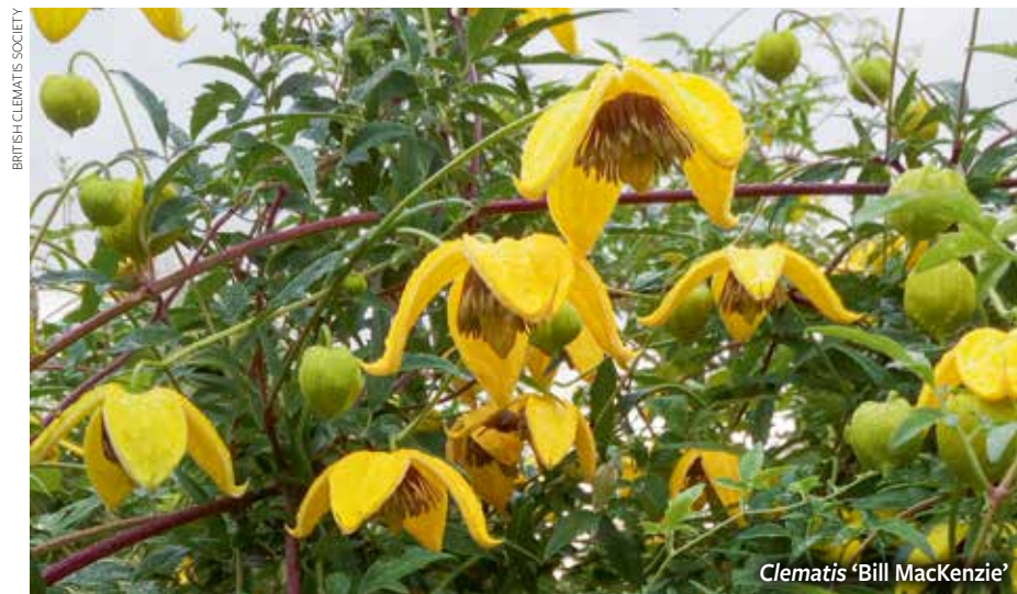
Clematis 'Bill MacKenzie'