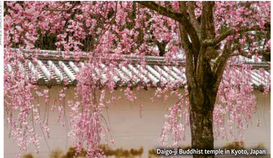
Daigo-ji Buddhist temple in Kyoto, Japan