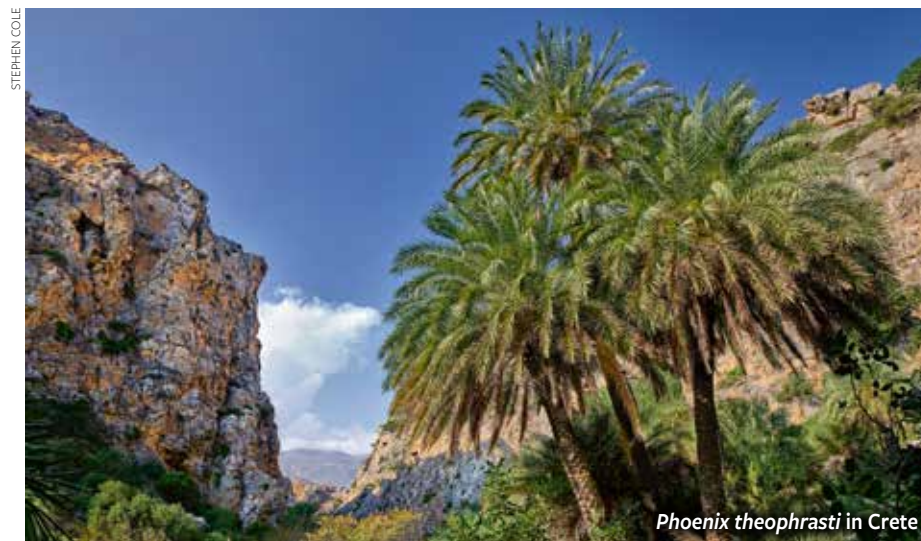
Phoenix theophrasti in Crete