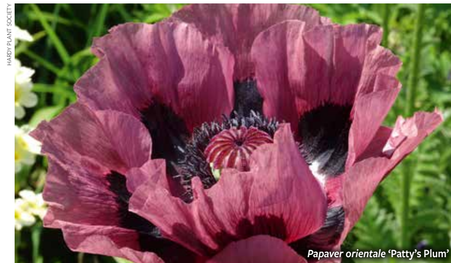
Papaver orientale 'Patty's Plum'