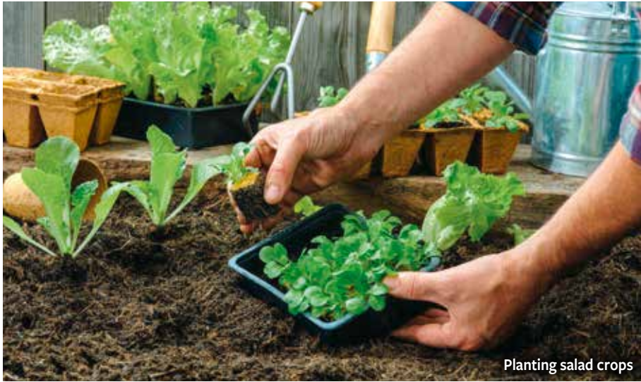
Planting salad crops