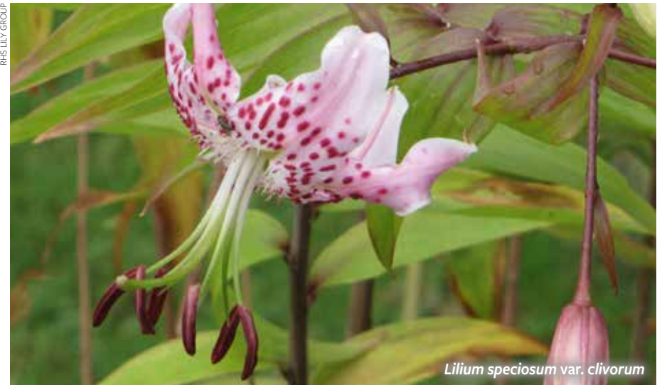
Lilium speciosum var. clivorum