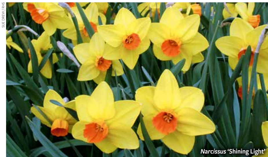
SUE DREW / RHS