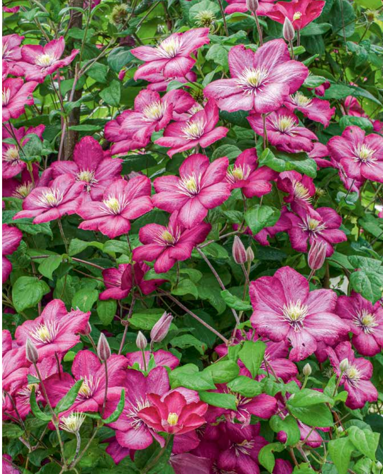
CLEMATIS 'VILLE DE LYON'

For more information visit rhs.org.uk/plants/plantsmanship/ plant-societies