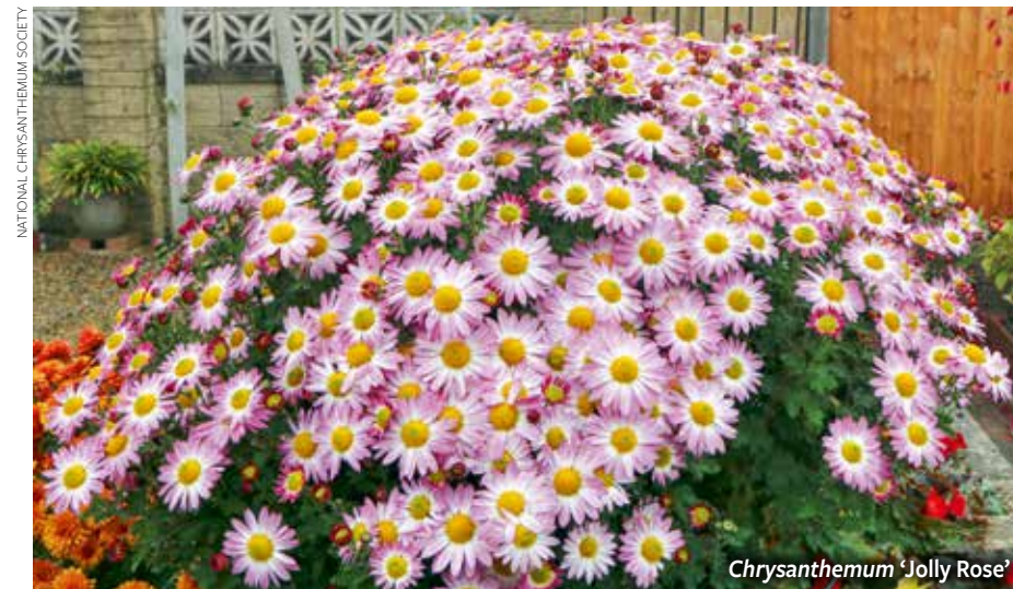
Chrysanthemum 'Jolly Rose'