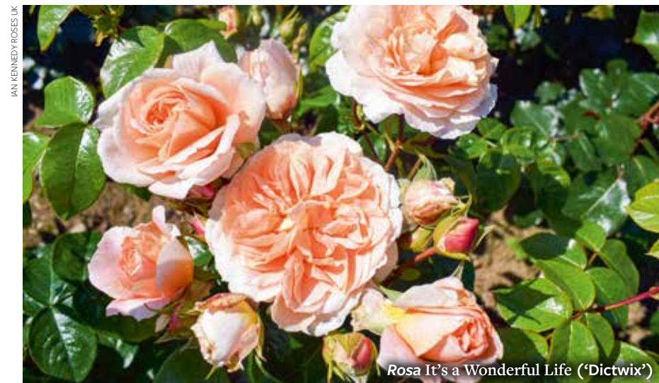
Rosa It's a Wonderful Life ('Dictwix')