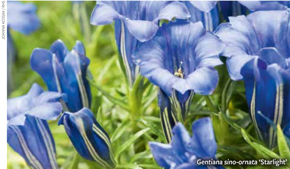
Gentiana sino-ornata 'Starlight'