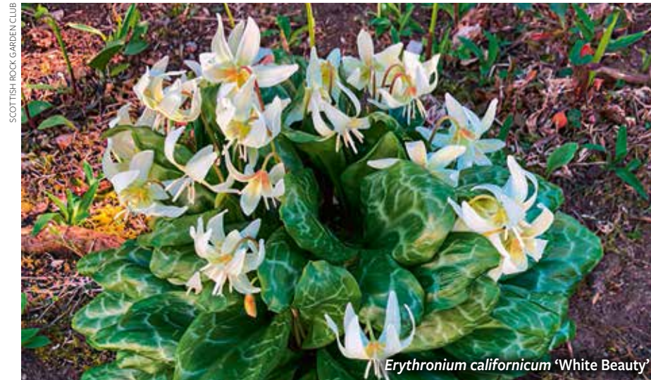
SCOTTISH ROCK GARDEN CLUB