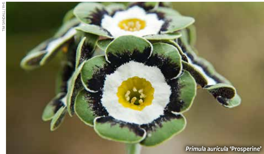
Primula auricula 'Prosperine'