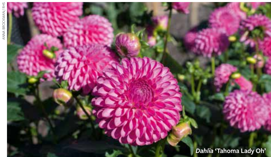
Dahlia 'Tahoma Lady Oh'