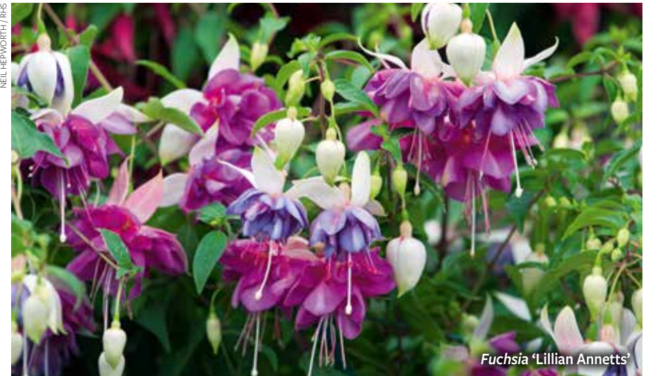
Fuchsia 'Lillian Annetts'