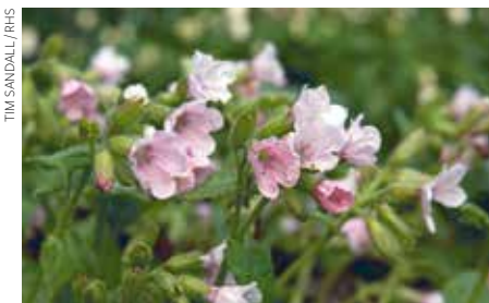
TIM SANDALL / RHS

This group of plants includes anemone, clematis, delphinium and thalictrum. It gets its name from 'rana', the Latin for frog, because many like damp conditions, but are adaptable and widely grown. ranunculaceae@hardy-plant.org.uk