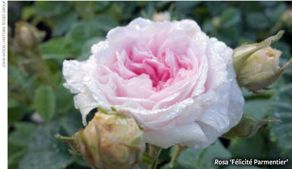
Rosa 'Félicité Parmentier'