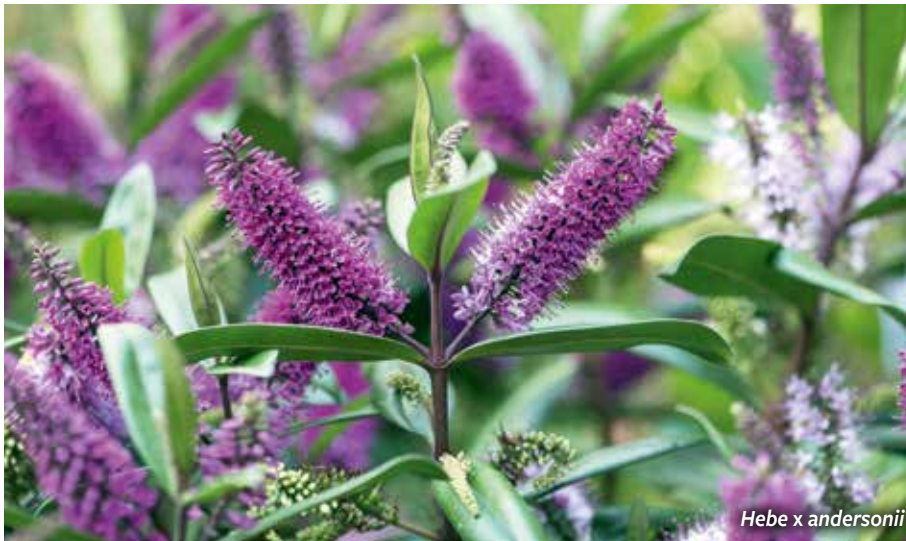
Hebe x andersonii