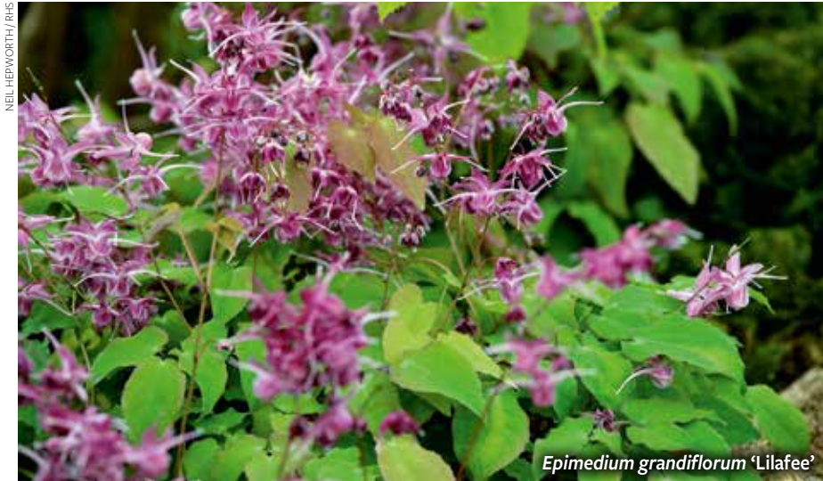
Epimedium grandiflorum 'Lilafee'