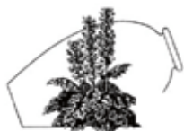
The Mediterranean Garden Society