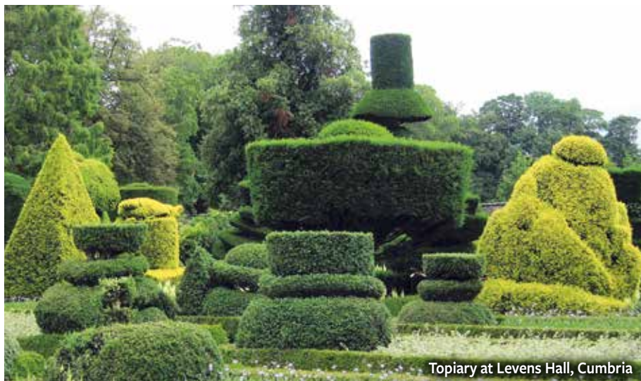
Topiary at Levens Hall, Cumbria