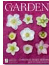
December 2009 pp773-842