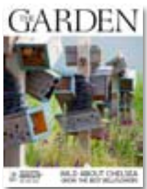
July 2009 pp433-502