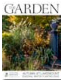
October 2009 pp637-706