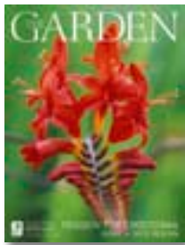
September 2009 pp567-636