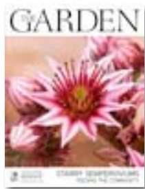
August 2009 pp503-566